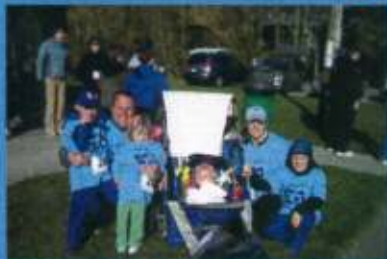
Run with your FAMILY...