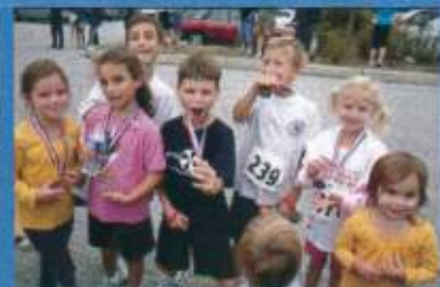
Run for LIFE!