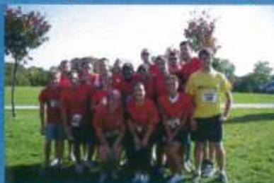
Run with your FRIENDS...