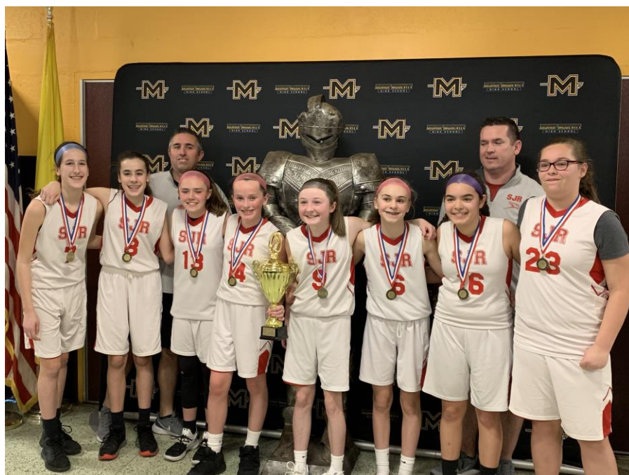
2019-2020 St. Joseph/St. Robert JV Girls CYO Regional Team - Archdiocese of Philadelphia Region 11 Champions