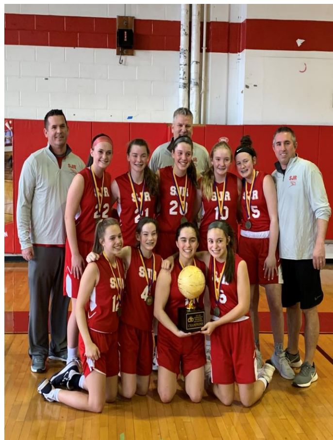
2019-2020 St. Joseph/St. Robert Varsity CYO Region Basketball Team – Archdiocesan Champions