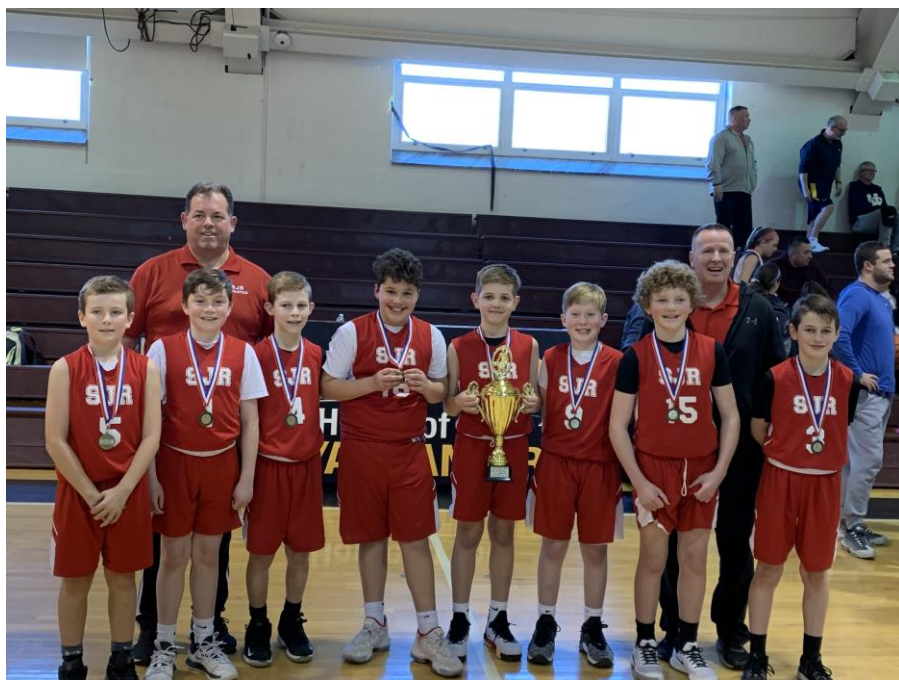
2019-2020 St. Joseph/St. Robert JV Boys CYO Regional Team - Archdiocese of Philadelphia Region 11 Champions