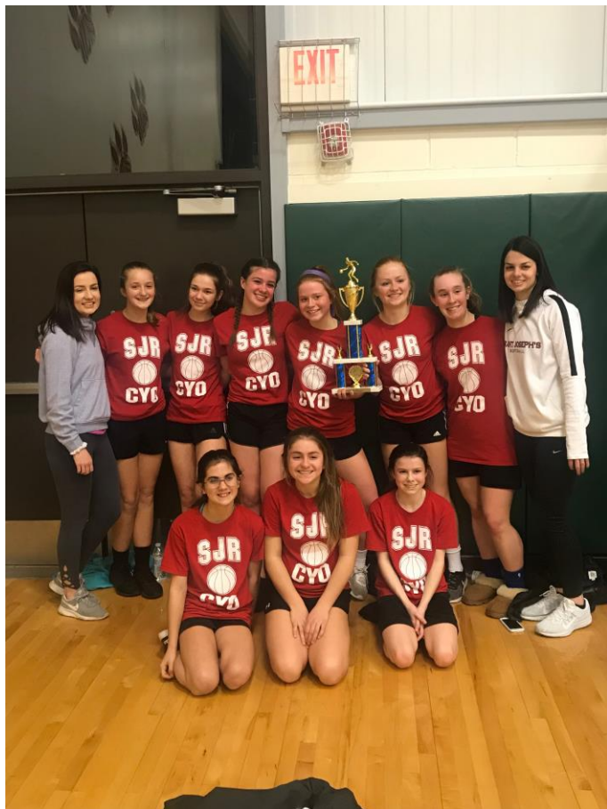
2019-2020 St. Joseph/St. Robert Varsity CYO Parish Basketball Team - Season Tournament Runner Up