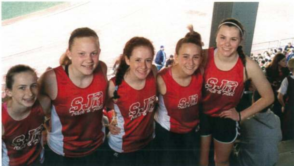
2015 Senior Girls Penn Relays Team