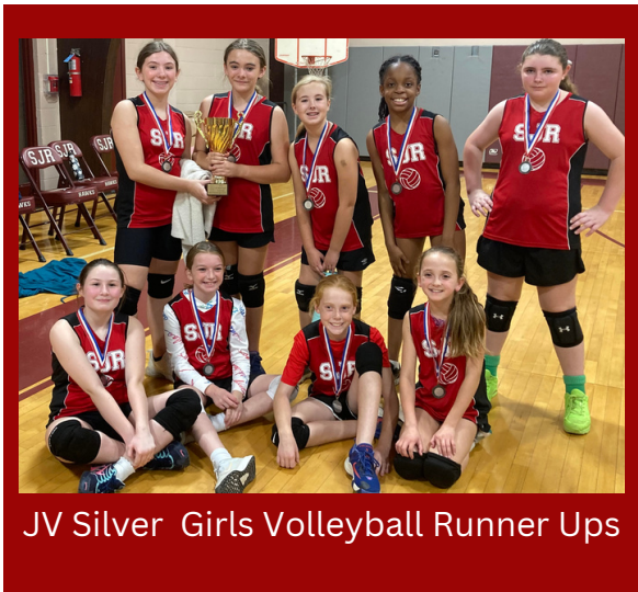
JV Silver Girls Volleyball Runner Ups

Thank you to all of the school families who supported our pie sale. The pie pickup will be on Wednesday, November 23rd.