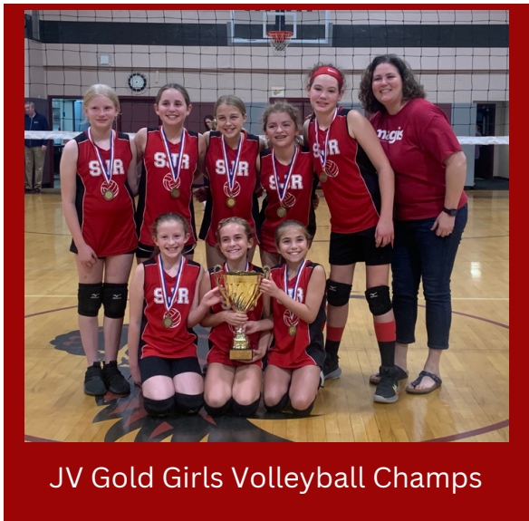
JV Gold Girls Volleyball Champs

While all of us Phillies fans are recovering from our disappointment about the World Series loss, we have so many other reasons to celebrate! We are all so happy for the JV Gold Girls Volleyball team which won the CYO Championship and the JV Silver Girls Volleyball team which was the runner-up in their division. Well done, girls!