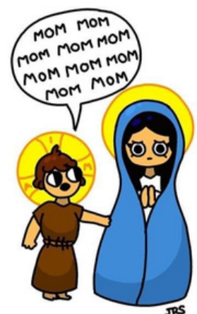
The First Rosary